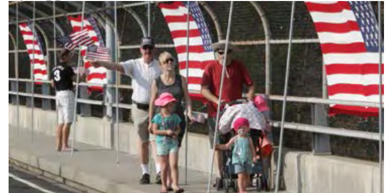
The Flag Brigade will mark 15 years since 9/11.